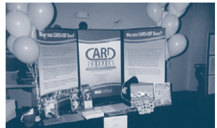
The CARD display table at Autism Walk 2006