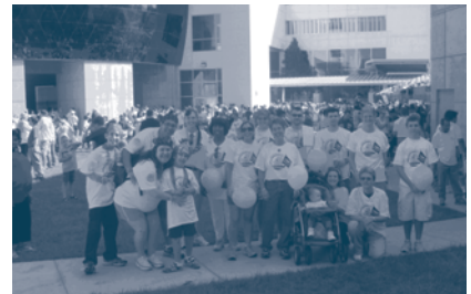
The CARDaneer crew takes a moment to enjoy the Autism Speaks festivities

Sunday, February 11th: A Gift of Love, Auction for Autism!