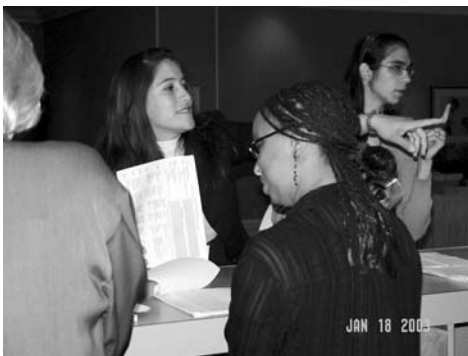
Registration went smoothly thanks to CARD staff and Volunteers