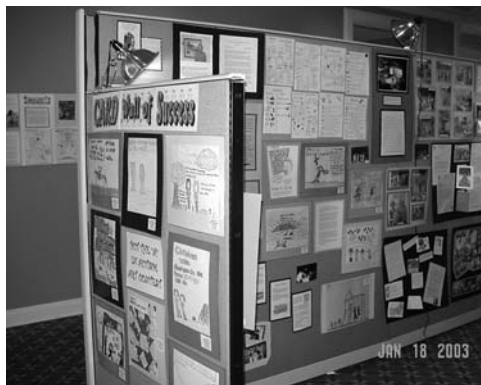
CARD Wall of Success

In January, CARD celebrated its tenth annual conference, A Decade of Commitment for People with Autism, Deaf-Blindness, and Related Disabilities and Their Families, at the Hilton St. Petersburg. The conference welcomed over 450 attendees from around the state, with even a few individuals from outside Florida. In celebration of 10 years of service, CARD created the agenda booklet in the form of a yearbook, showcasing all the CARD centers' staff and speakers for the conference.